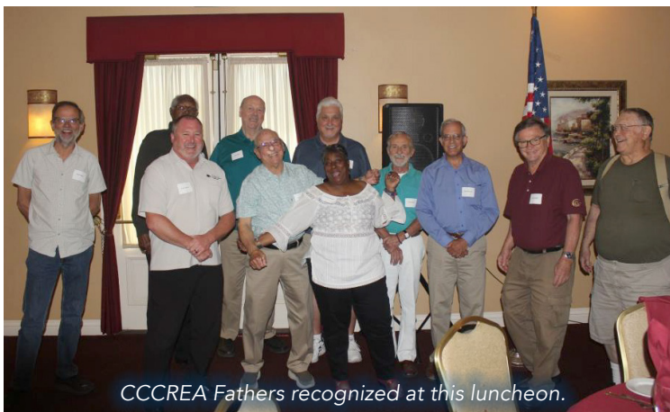
CCCREA Fathers recognized at this luncheon.

Reservations are required. Deadline for reservations is on Thursday, June 3 rd , 2024.